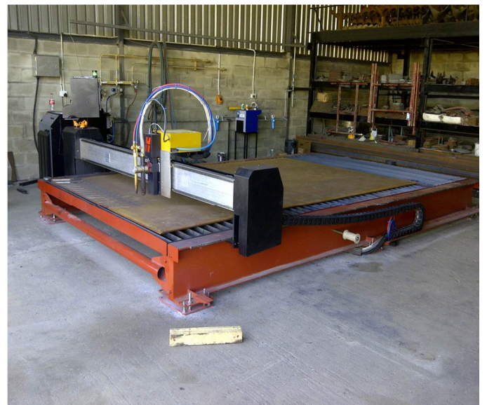
Figure 3 – The machine