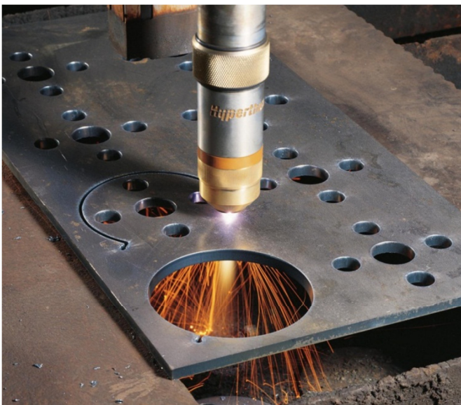
Figure 1 – High precision cutting